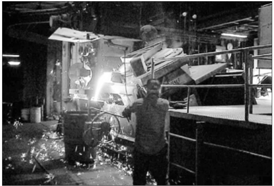
Quality materials and consistent melting processes are key to solid, long-lasting parts.

The manufacturer determined it needed to find another casting vendor – although at a slightly higher price – to save money in the long run. The Mexican vendor, however, was lauded for its efforts to make the grade and may be able to make product improvements once economical electric melting systems – which produce greater consistency – become available in that region. ■